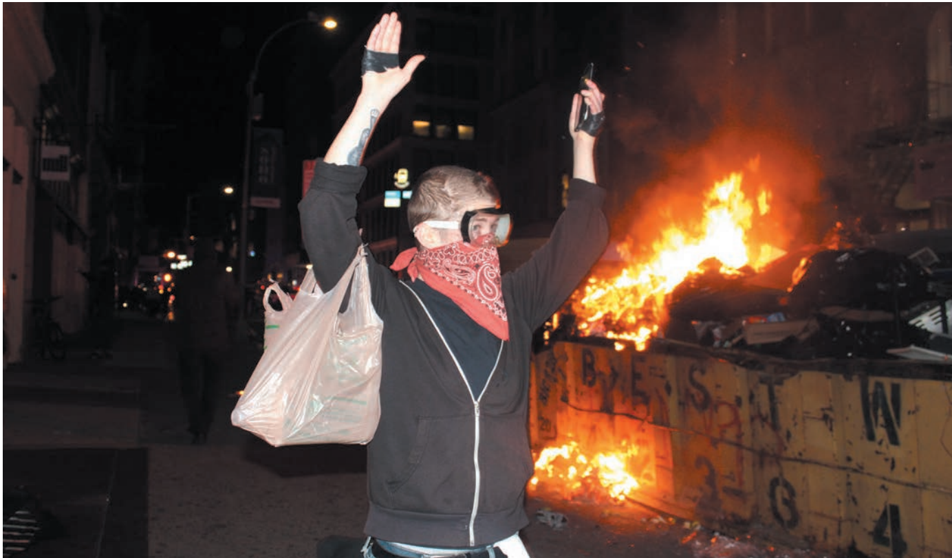
In this photo, a white man—of which there were plenty causing destruction—raises his taped hands as he passes a large container of garbage cans on fire. Officials and police believe much of the rioting and arson was the result of well-organized groups infiltrating peaceful protests, turning them into mindless riots.