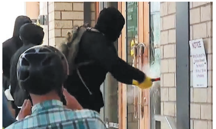
Leftist media outlets tried to blame the violence and looting on “white supremacists,” but that lie was demolished. Here a member of Antifa smashes a window so he and his pals could loot the store.