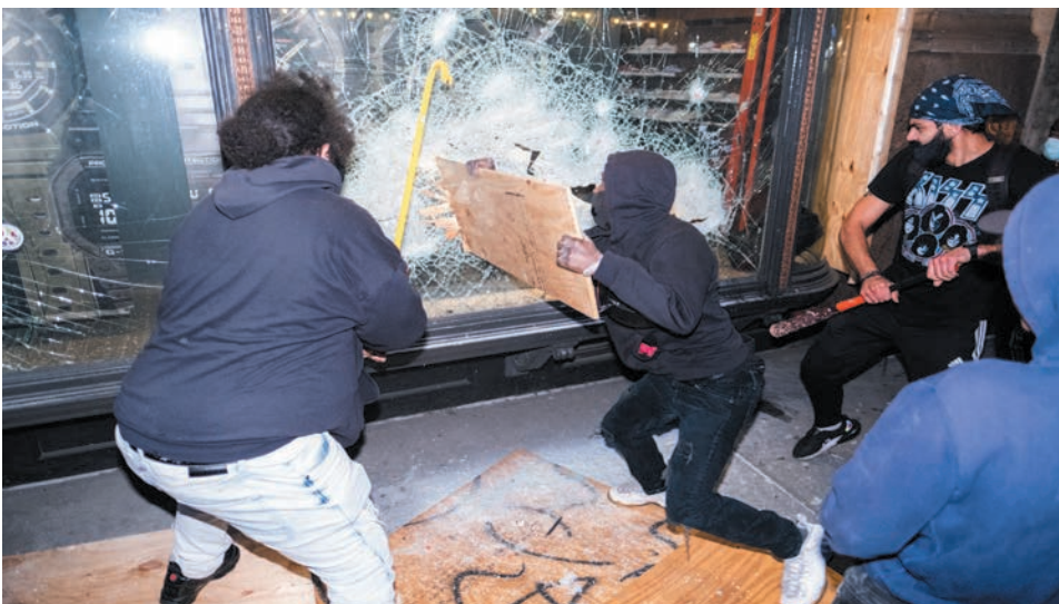
Looting continued for days in Manhattan after protests over the death of George Floyd turned violent. Hundreds of stores were looted in and around Union Square, as shown in this photo by Stephen Yang.

Leftist media outlets downplay mayhem that was perpetrated under the cover of many peaceful protests