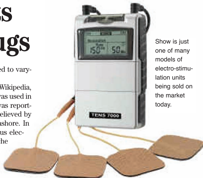
Show is just one of many models of electro-stimulation units being sold on the market today.

“American inventor Benjamin Franklin advocated the use of electro-stimulation.”