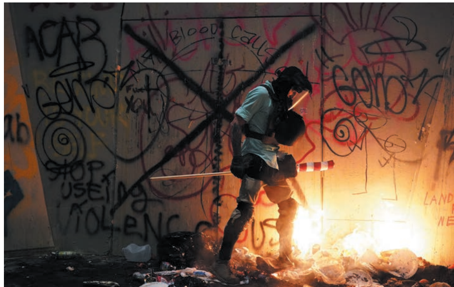
Will Portland, Ore. ever be the same? Will Antifa ever be held accountable for the lives and businesses they have ruined? Above, sections of Portland look like a war zone.

“As officers from other precincts approached to access the intake for the Multnomah County Detention Center, the hostile group surrounded their cars,” the press release noted. “Traffic was very