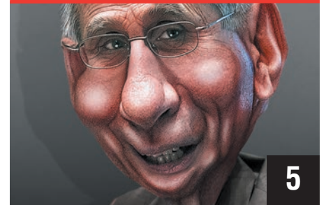
Anthony Fauci’s legacy of failure and the AIDS epidemic examined.