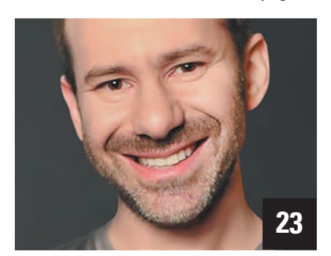
How one tiny nation managed to purchase U.S. foreign policy. See page 23