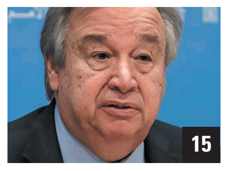
UN integrally involved in aiding migrant invasion of United States. See page 15