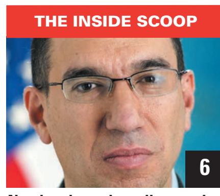
Newly released emails reveal extent of online censorship. See page 6