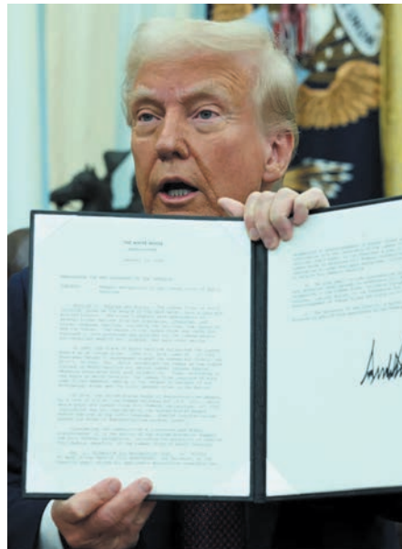
DONALD TRUMP Shaking things up—fast.

The order directed federal agencies to "temporarily pause all activities related to obligation or disbursement of all federal financial assistance," beginning Jan. 28 at 5 p.m. While the memo did not directly name which programs would be impacted, it did cite carve outs for Medicare and So-