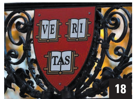
What is going on behind the scenes at Harvard University?