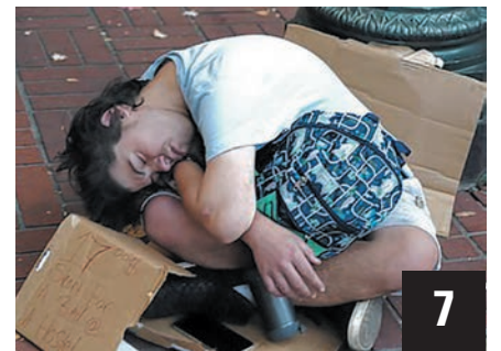
Legalization of hard drugs has increased crime and addiction.