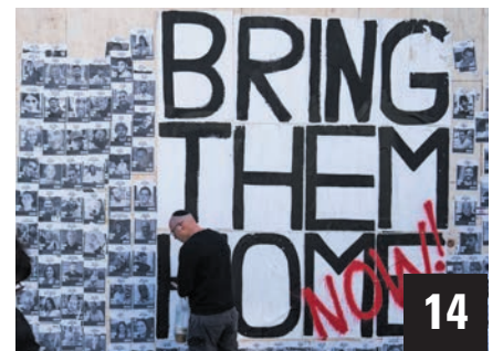
Israel prime minister rejects any notion of two-state solution.