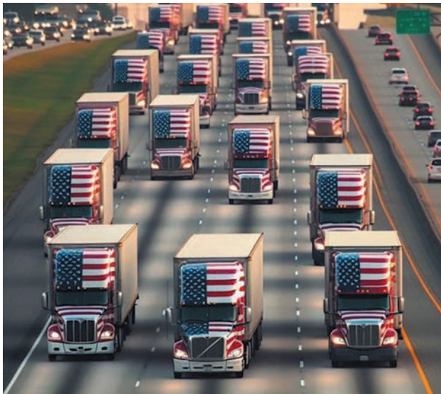
Members of a "border convoy" are also headed to border states to protest and help where they can.

criminals from coming into our state, to make arrests of those criminals—and we have National Guard as well as Texas Department of Public Safety officers who are there to make those arrests and to deny illegal entry," Abbott told Fox News on Jan. 25.