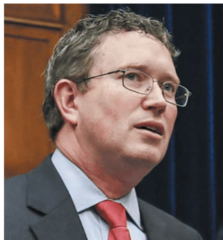
REP. THOMAS MASSIE Lone GOP "no" vote.

Recently, Rep. Thomas Massie (R-Ky.) came under fire for daring to point out this very fact, i.e., that Congress prioritizes the interests of Israel and international Zionism over the American people.