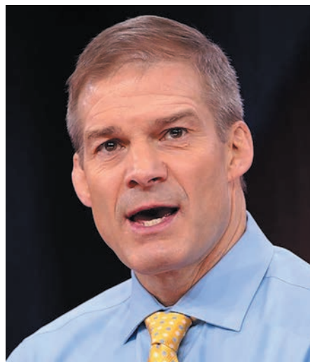
REP. JIM JORDAN Exposed a network of saboteurs.

Jordan explained that the congressional committee he chairs documented how the federal government went far beyond what anyone previously thought