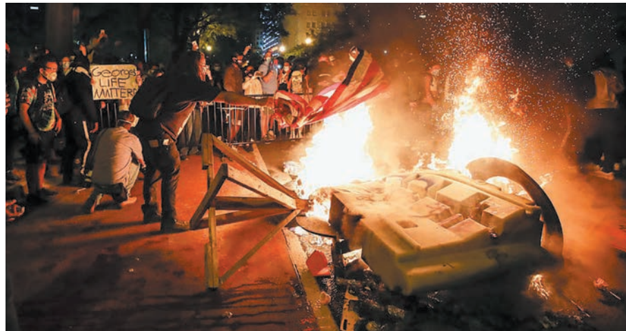
Leftist groups have promised more violence and mayhem no matter who wins the elections. Above, riots in Washington, D.C. earlier this year.

ShutDownDC and other far-left groups have promoted a document subtitled, “The Disruption Guide for 2020,” openly detailing their plans to disrupt the country by staging massive street protests across the nation in an effort to shut down and cripple the country and intimidate the winner into acceding to their demands.