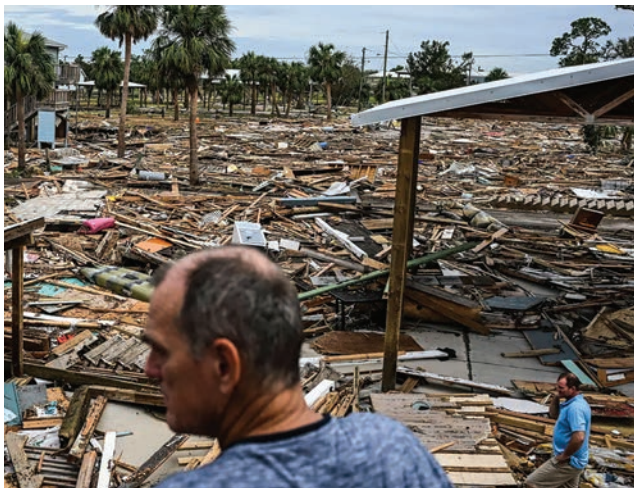
A man returns to what was once his Florida community only to find it wiped out by Helene's flood waters. American citizens are in dire need of massive assistance right now. Unfortunately, our government is very good at giving billions of your tax dollars to other nations, but not nearly enough to people right here when they need it most.

That sounds like a lot of money, but, when you account for the millions of Americans in Tennessee, Florida, Georgia, South Carolina, and North Carolina