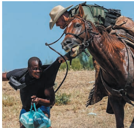
Those are reins, not a whip, for those leftists who have never ridden a horse while trying to apprehend a struggling fugitive carrying multiple containers of “carry-out” food on the bank of a river.

For weeks, the mainstream media has been ghoulishly gloating over the deaths of conservatives, who have refused to get vaccinated for Covid, but there was no mention of the potential risks from the tens (if not hundreds) of thousands of illegal immigrants who may be infected with Covid-19 and other communicable diseases. These alien invaders are now