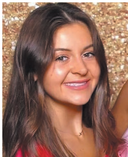
LAKEN RILEY Death not in vain.

Unlike a lot of legislation these days, the Laken Riley Act isn't packed with pork or handouts to wealthy donors. Instead, it sticks to one issue that figured prominently in the last election: illegal immigration. It would