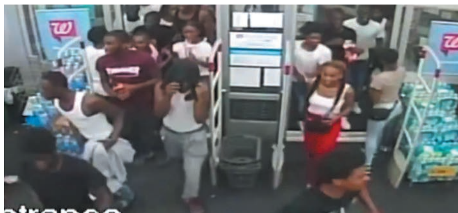
Surveillance video shows a Walgreens being looted by “brutes.”