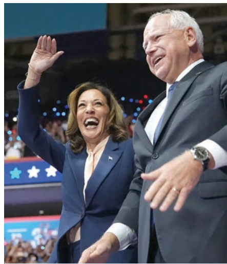
KAMALA HARRIS & TIM WALZ Fellow travellers.

In other words, the Democrats want to throw out the Constitution and centralize election law so they can better control it.