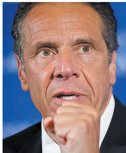
ANDREW CUOMO Reversing course on police.

In Minneapolis, a “sacred space” dedicated to George Floyd in one downtown area has been the site of rising criminal activity—and locals and business owners have had just about enough of it. Over the last year, reports National Review , there have been