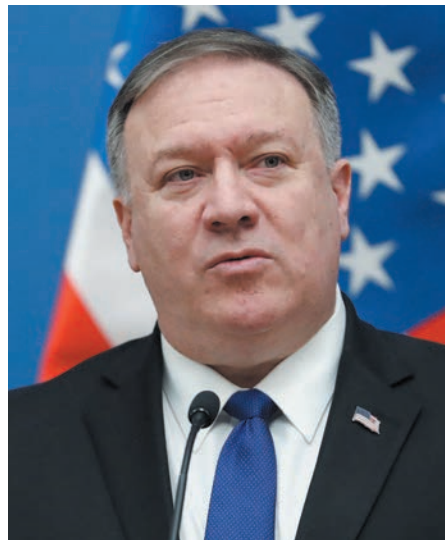
MIKE POMPEO Wants to start war with China.

Since the war in Ukraine first began four months ago, the results have been devastating. Nearly 75,000 Ukrainians and Russians have been killed, and, according to Ukrainian