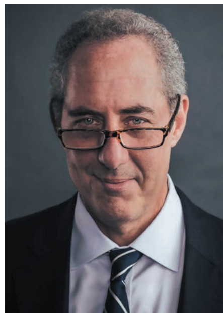
The CFR announced last year that Michael Froman—a government and nonprofit sector insider—would become its 15th president, succeeding Richard Haass, who was CFR president for 20 years.

“When we had an agreement on climate [that] President [Barack] Obama struck with Xi Jinping, when we thought we had an agreement together on Iran’s nuclear program, we always emphasized all of the commonality of interests,” Sanger told host and current CFR President