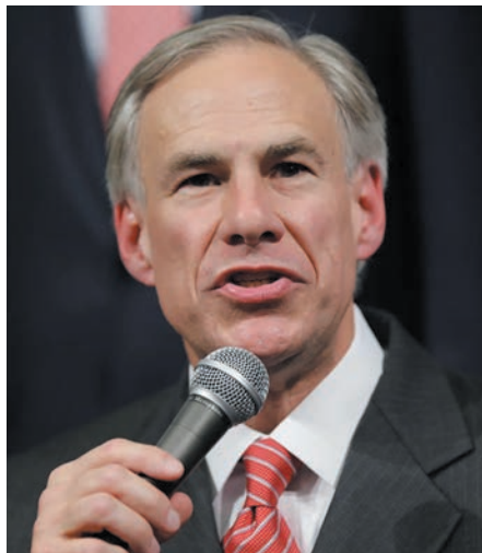
GREGG ABBOTT Battling Biden on the border.

The bill has already been challenged by far-left groups hellbent on destroying the sovereignty of America and completing the Great Replacement via unchecked mass migration, including both illegal immigration and the record number of extremely dubious asylum claims made