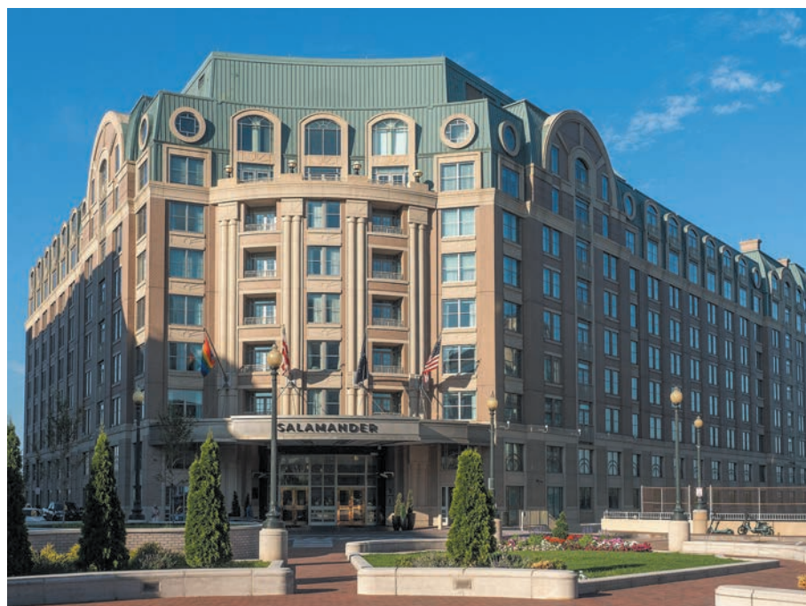
The Salamander Hotel, site of this year's Bilderberg meeting.

On Feb. 28, at the behest of Israel, President Trump authorized the U.S. military to attack Iran, kicking off a regional war that has, so far, cost U.S. taxpayers over $200 billion.