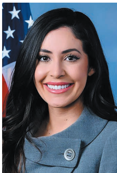
REP. ANNA PAULINA LUNA Head of declassification effort.

In the immediate aftermath of the 2016 election, the FBI targeted Trump officials and advisors, making the claim that Trump and his staff had colluded with Russian officials to steal the election. It took two years and tens of millions of taxpayer dollars but, eventually, Trump and his aides were cleared of