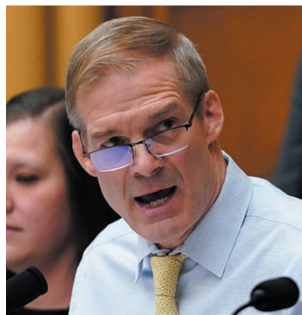
CHAIRMAN JIM JORDAN

He added, “This subcommittee has unearthed documents showing that our country's largest banks are working with law enforcement to profile Americans as domestic terror threats if they buy religious texts or firearms or