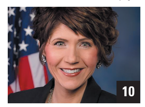
Multiple Trump cabinet picks want criticism of Israel stifled.