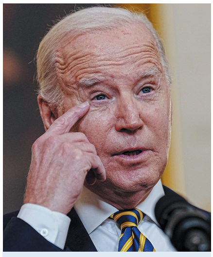
JOE BIDEN Aware of what's happening?

In the run-up to the election, Trump said one of his top priorities in office will be to negotiate a lasting peace deal between Ukraine and Russia.