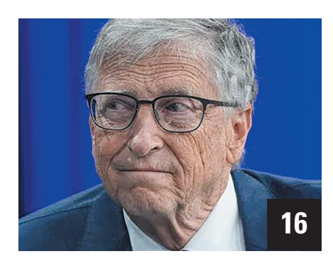
Gates wants to control weather to reverse "climate change."